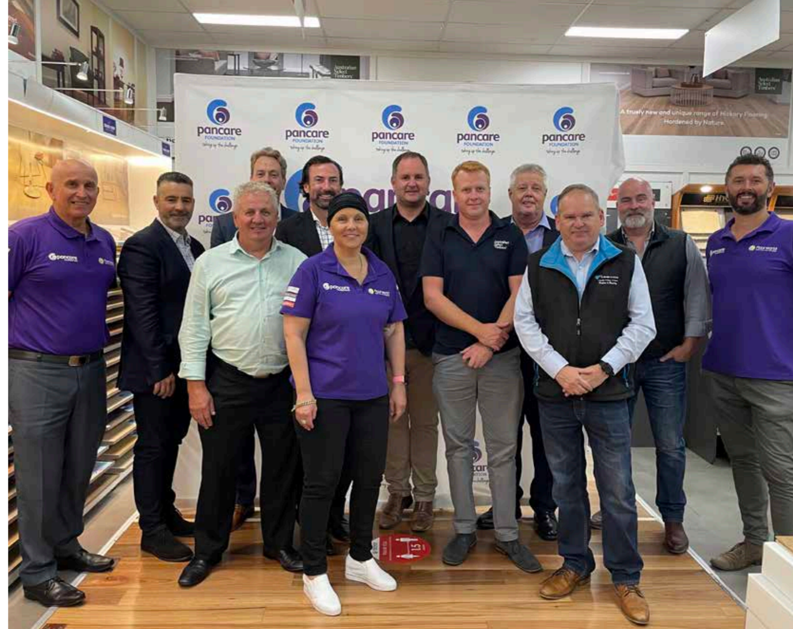
Corporate partners, Floorworld and supplier partners